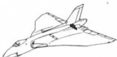
CONTROLS FLYING IN REAR PORTION, FUSELAGE.