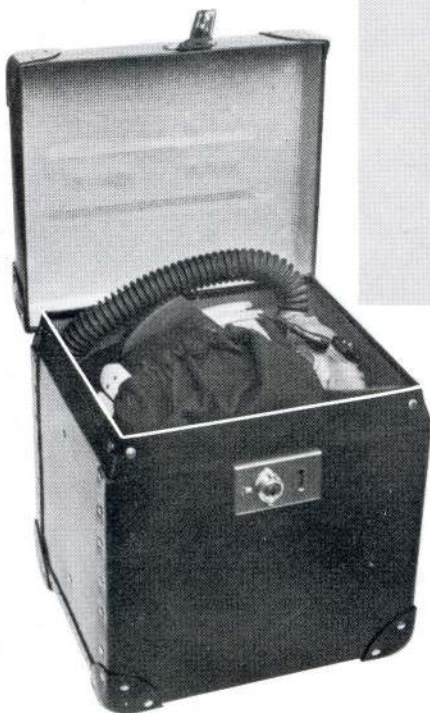
FIBRE CARRYING CASE Holds both inner and outer helmets, oxygen mask and goggles or visor.