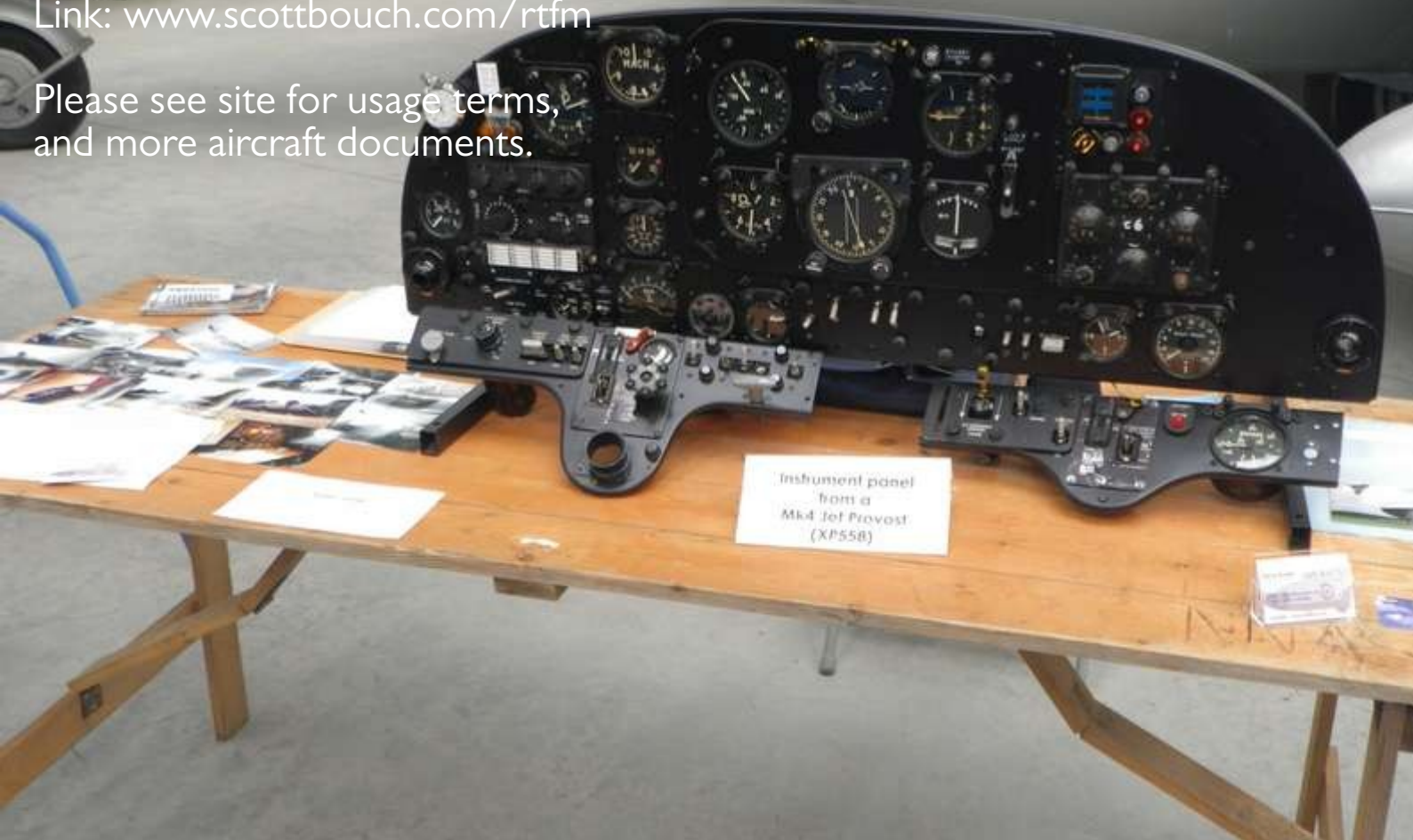
Instrument panel from a MiG-21 (XP558)

Please see site for usage terms, and more aircraft documents.