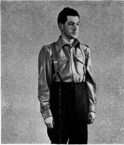
Fig. 2. Aircrew shirt