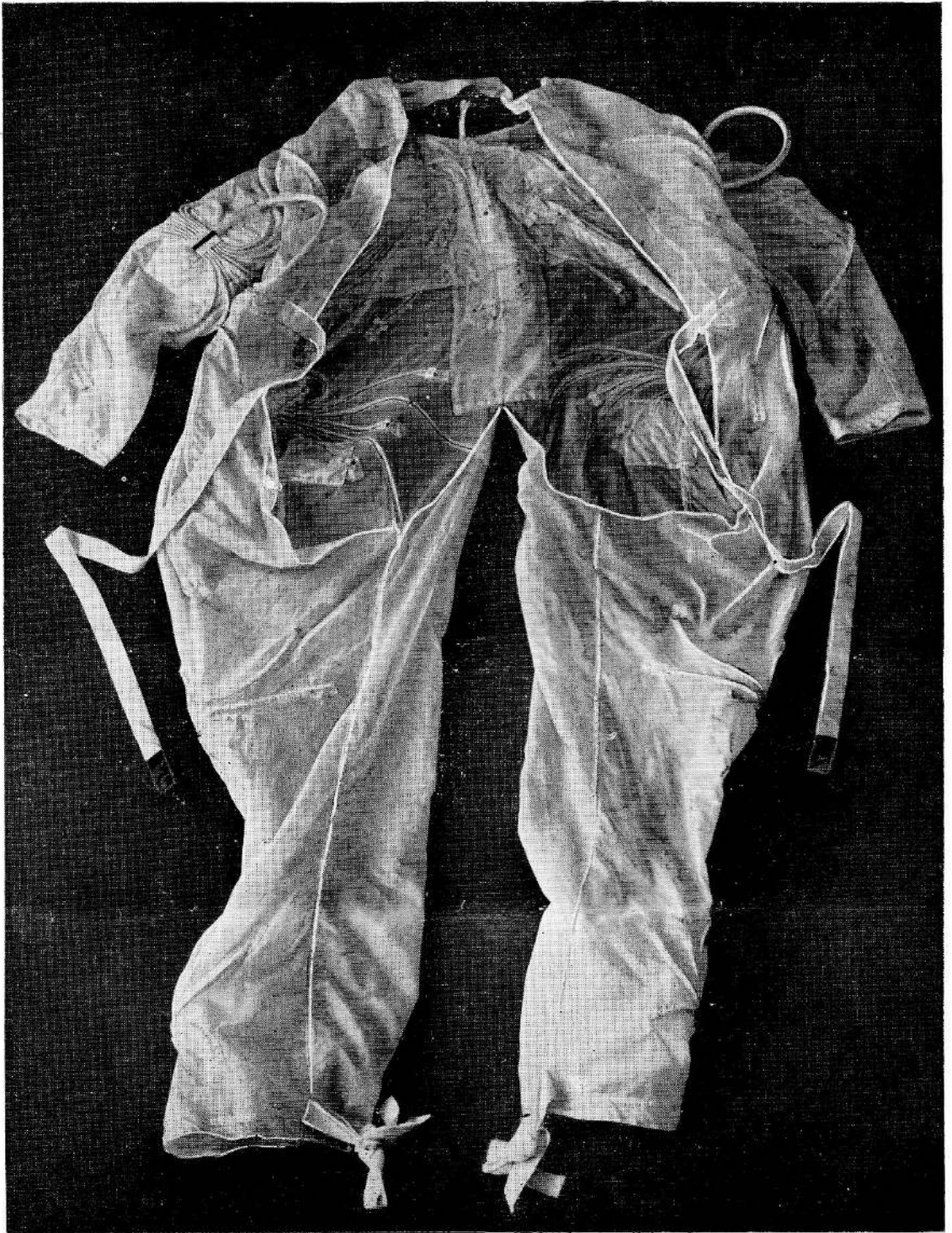
Fig. 2. Air ventilated suit, Mk. 2 : back view