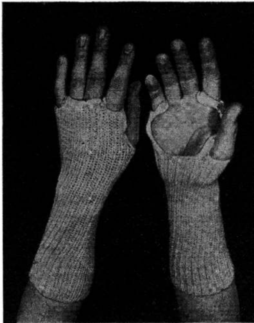
Fig. 3. Woollen wristlets, 1951 pattern