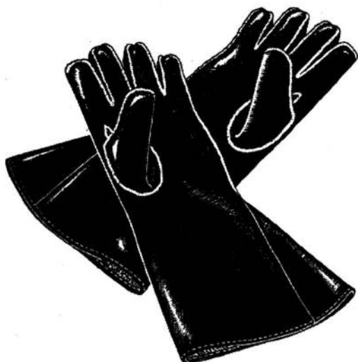
Fig. 1. Cape leather outer gauntlets