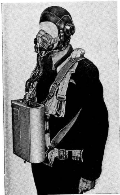
Fig. 2. Portable oxygen set, Mk. 3

minutes at 35,000 ft. The cylinder can be re-charged in flight from a re-charging valve in the aircraft oxygen supply.