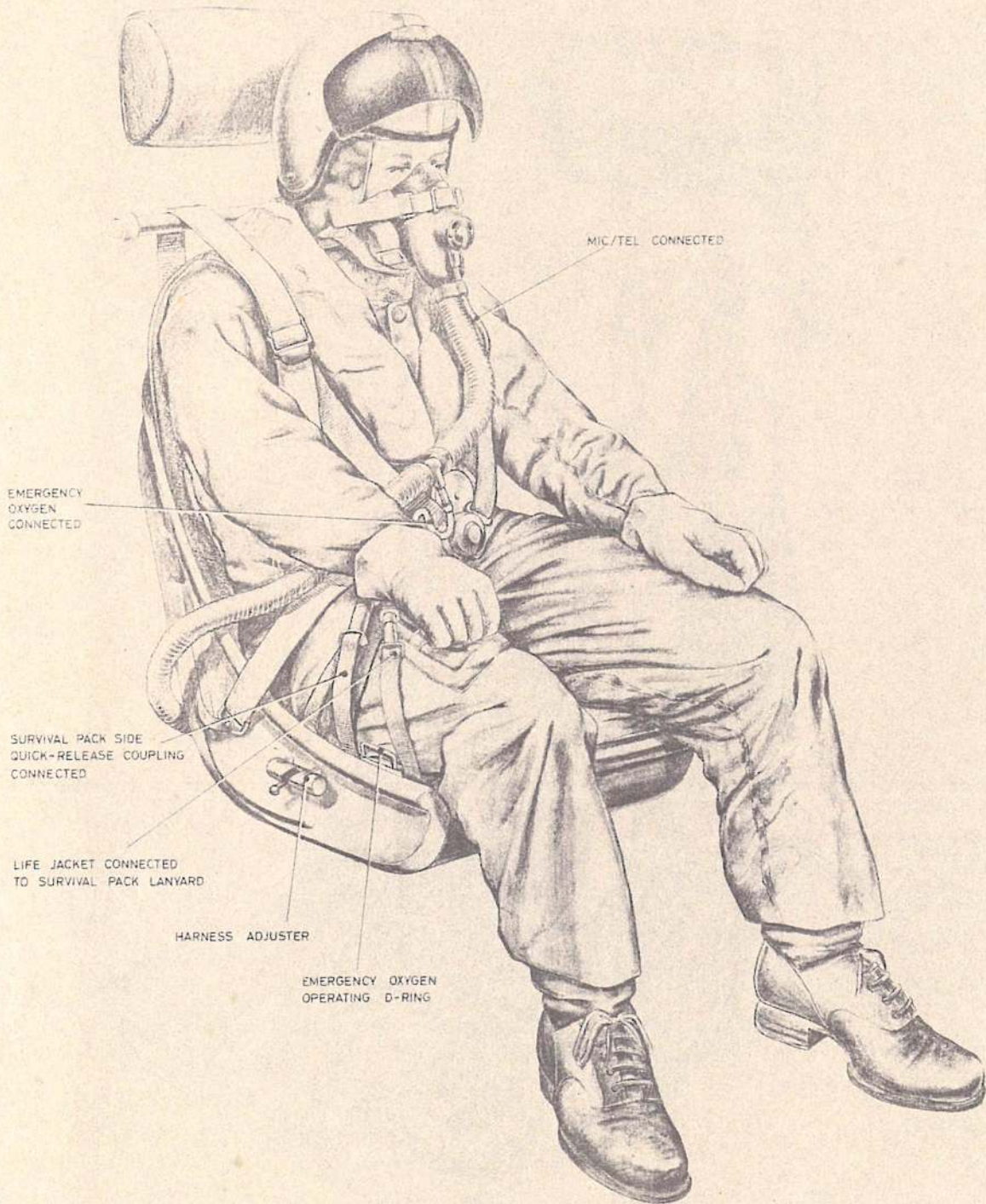
Fig. 2. The static seat occupied