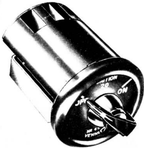
Fig. 1. Time switch, Type PTC/DH/20

a stop on the centre spindle prevent travel of the pointer beyond the appropriate limits. The dial is protected by a transparent shield, and is located by three dowels on the top plate.