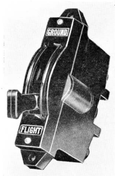
Fig. 1. Ground/flight switch, Type C

3. The base, lever and cover of the switch are of moulded bakelite construction, with a blade of high-conductivity copper inserted in the lever ( fig. 2 ). The cover is secured to the base moulding by two rd/hd. screws.