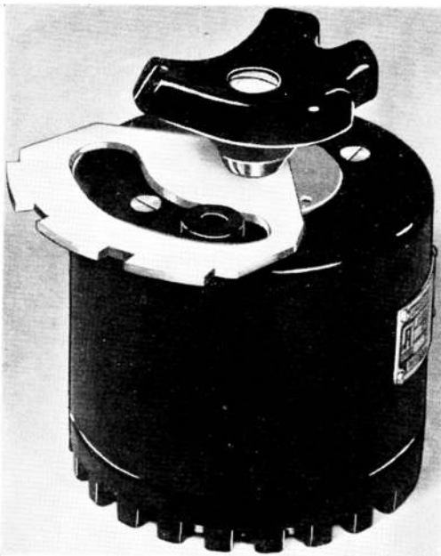
Fig. 1. General view of Type 3B, No. 2 switch