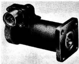
Fig. 1. General view of solenoid

2. Solenoids, Type D.7203 and Type D.7204, differ only in the direction of the terminal plug. When viewed from the end cap, the plug points in an anti-clockwise direction for Type D.7203, and in a clockwise direction for Type D.7204 (this type being illustrated in Fig. 1).