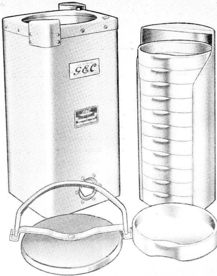
Fig. 1 Container, Type H.O. 3373

container and the elements is the aluminium foil lagging, held off the heaters by distance pieces. At the bottom of the container is the tap adaptor which passes through the outer casing to accommodate the tap. Provision is made for the space between the container and the casing to breathe with change in air pressure due to varying altitude by a pressure vent at one corner of the inner container top plate, on an adjacent corner is fitted the electrical connector plug.