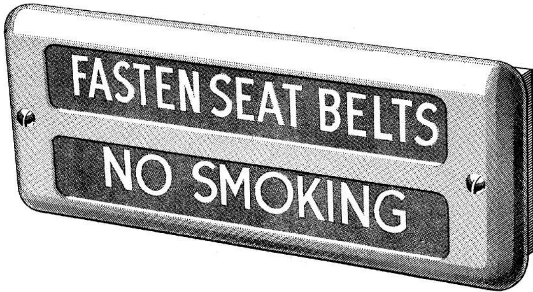
Fig. 1. General View

Illumination is by the festoon lamps situated at each end.