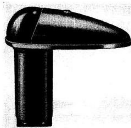
Fig. 1. Wing tip navigation lamp, Type WNL/30