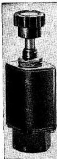
Fig. 1. General view of pilot's control unit, Type A.W.E. 149

3. The Type 149/4 differs from Type 149/3 by the introduction of Mod. E/289, which removes the internal link between terminals 3 and 6 of the two potentiometers.