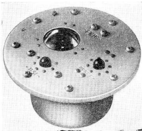
Fig. 1. External view

1. The crash lamp, Type 80/10/1505 is designed to give emergency lighting in the event of a crash to illuminate the aircraft cabins sufficiently to allow easy exit of the passengers and crew. The lamp is automatically illuminated, or may be operated by hand.