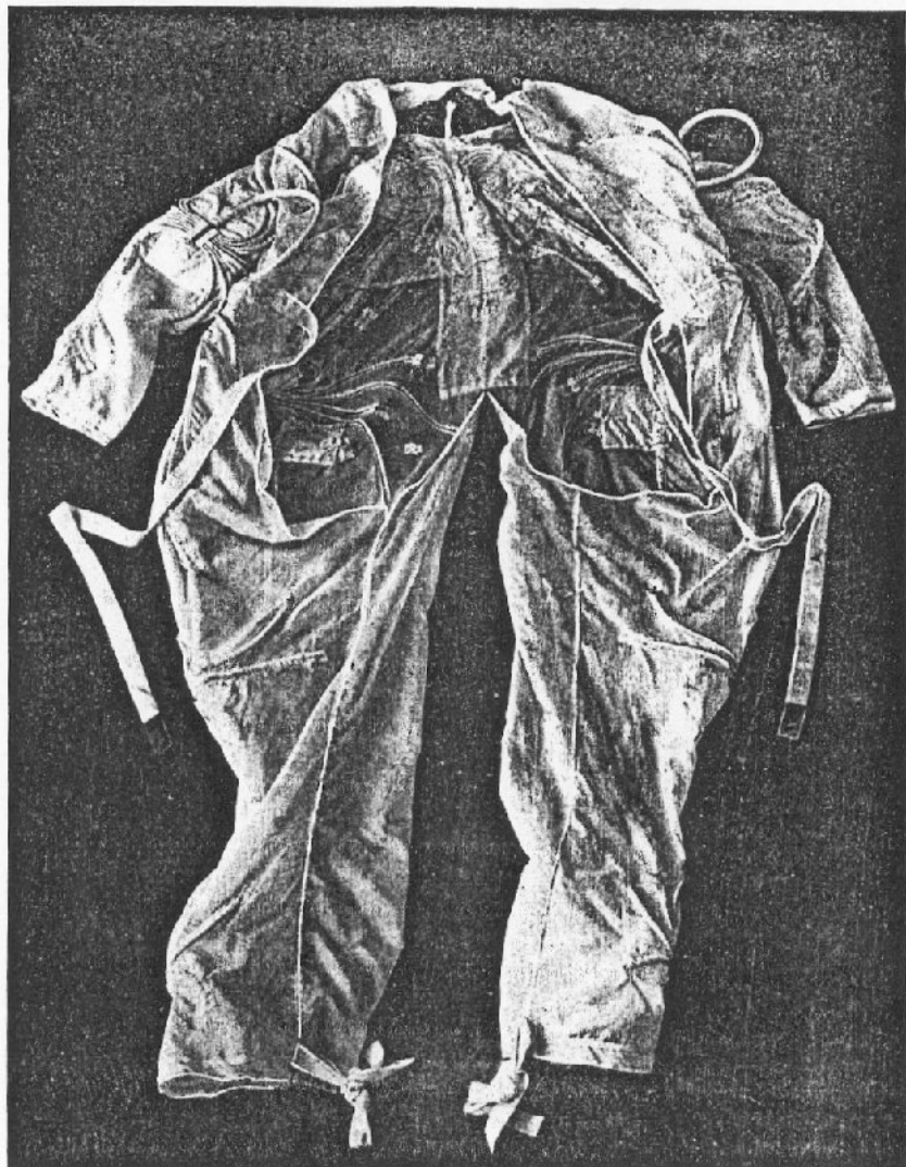
Fig. 2. Air ventilated suit, Mk. 2 : back view