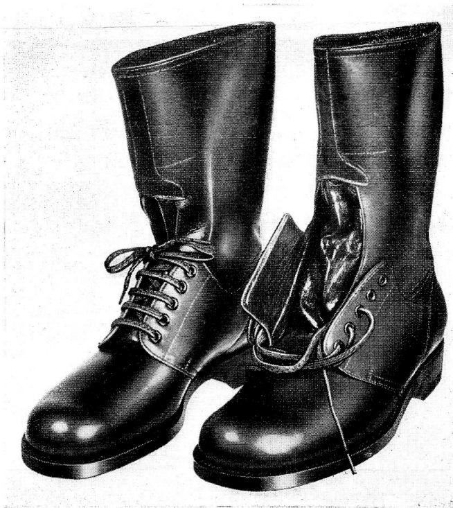
Fig. 2. Flying boots, 1952 pattern

Outer pair—Socks, woollen, undyed, ribbed knit (Stores Ref. 22C/1264-1268).