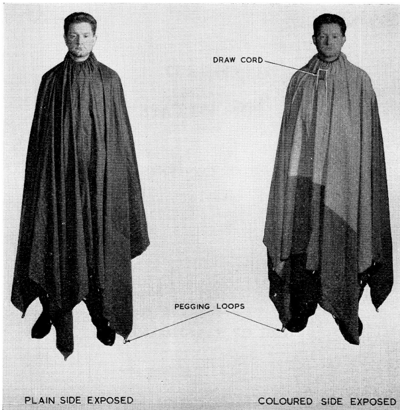
Fig. 1. Poncho cape