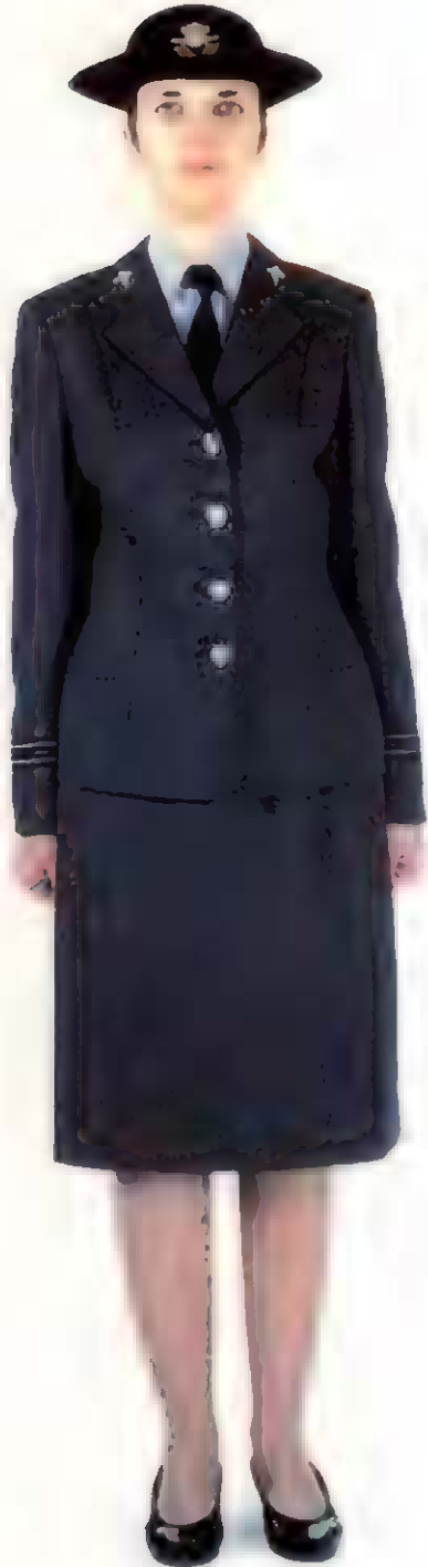
Officers No 1 Dress