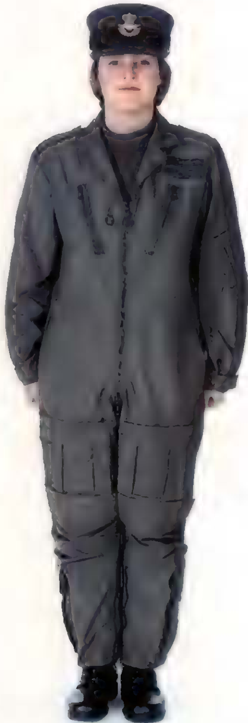
No 14B Dress