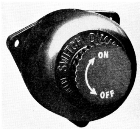
Fig. 1. Dimmer switch, Type E