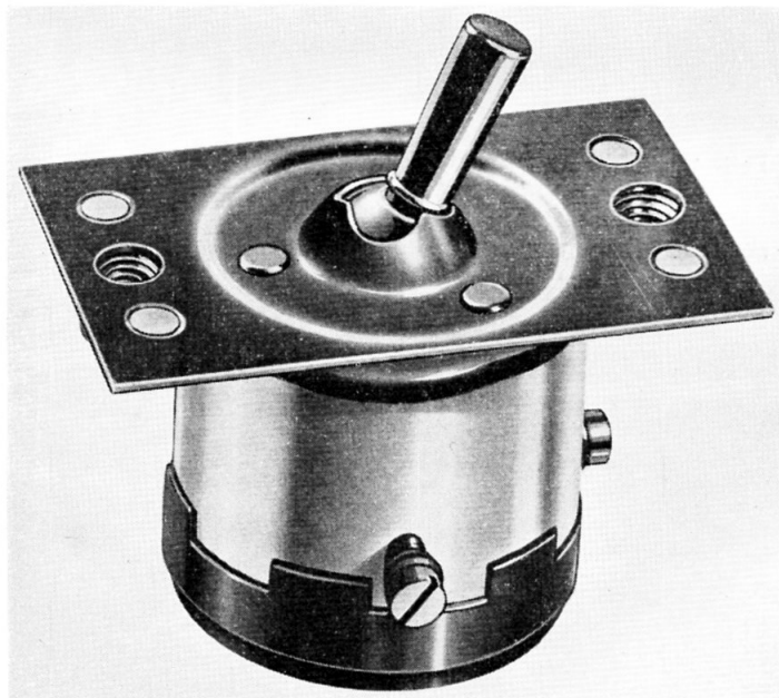
Fig. 1. Type 7B, No. 2, manually operated switch