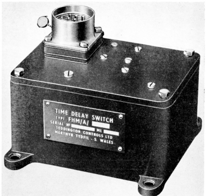
Fig. 1. Time switch, Type FHM/A/27

3. The switch ( fig. 1 ) is encased within a cast aluminium housing, the cover plate of which provides a base for the mechanism. The cover is secured by four 4 B.A. hex/hd. bolts, and has bolted to one corner of it a 9-pole Breeze plug. A rubber gasket between the housing and the plate, together