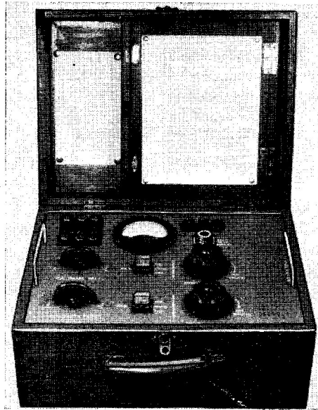
Fig. 1. Test set

Attached to the lid are operating instructions and a wiring diagram of the test set.