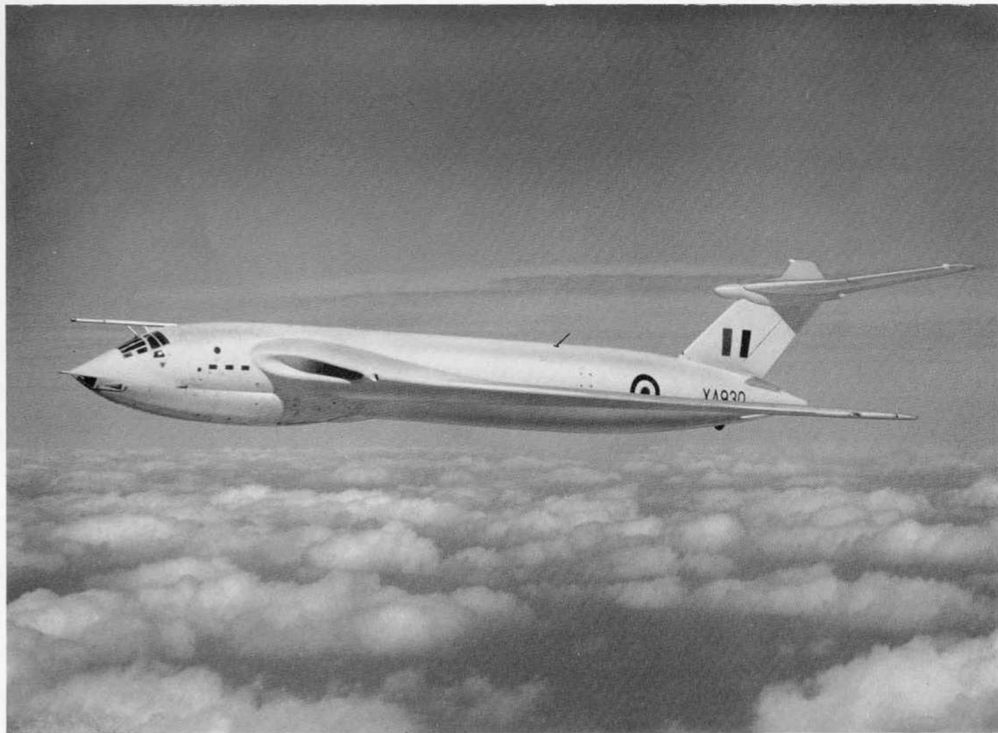
Victor B Mk. 1A